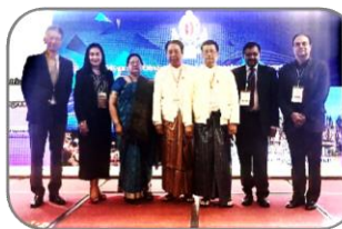
O&G Congress, Myanmar