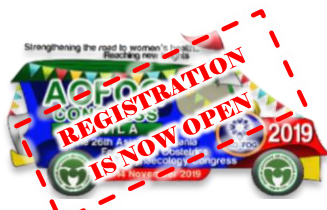
AOFOG CONGRESS 2019 - MANILA

Established 1957 | 28 Countries | secretariat@aofog.net