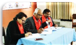
Signing of agreement regarding iCOE in Nepal