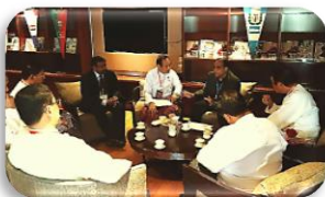
Meeting with the Minister of Health Myanmar