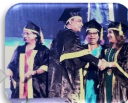
Honorary fellowship of ICOG