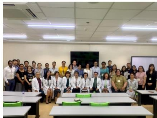
Far Eastern University - Nicanor Reyes Medical Foundation