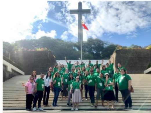
Mt. Samat National Shrine of Valour