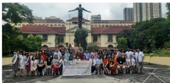
University of the Philippines - Philippine General Hospital