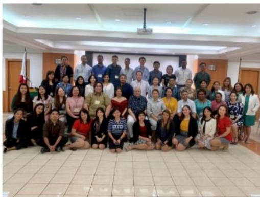
Philippine Obstetrical and Gynecological Society (POGS) Office