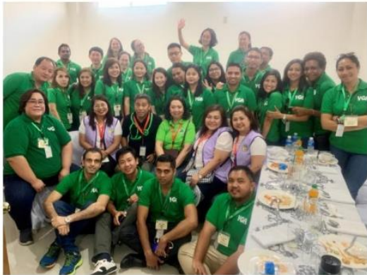
Bataan General Hospital and Medical Center