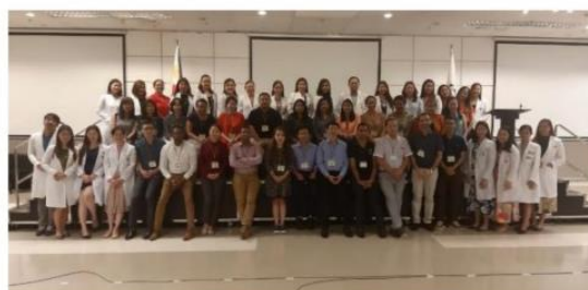
St. Luke's Medical Center Bonifacio Global City