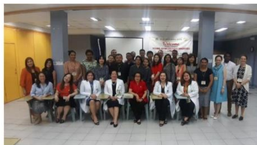
Dr. Jose Fabella Memorial Hospital