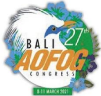
AOFOG CONGRESS 2021 - BALI

Established 1957 | 28 Countries | secretariat@aofog.net