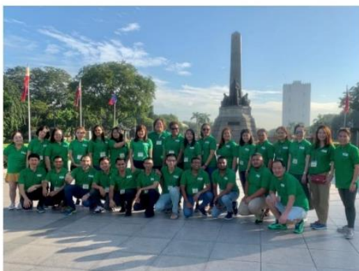
Dr. Jose P. Rizal National Monument