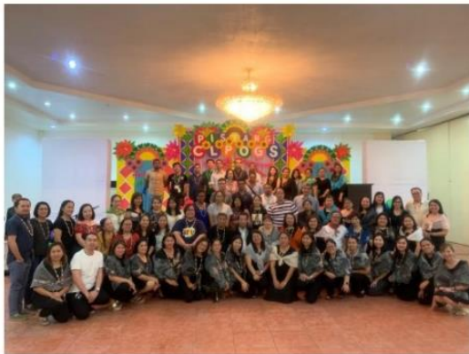
POGS Region 3 (Central Luzon) Fellowship Night